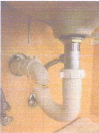
PVC LAVATORY P-TRAP