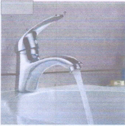
SINGLE COLD FAUCET