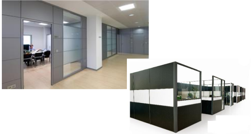
Low Office Workstation Partition