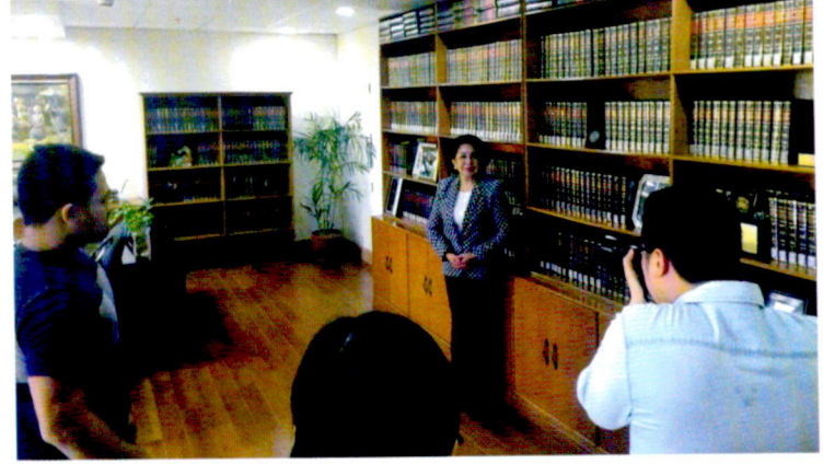
'THE FURY'. The opening spread of the 4-page feature on Ombudsman Morales published in the January 2016 issue of the PeopleAsia magazine.