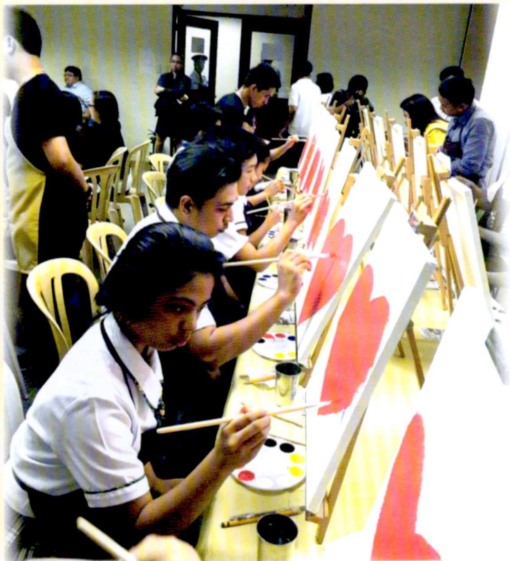
ARTISTIC CRUSADE. From the perspective of the youth, art takes on an idealistic form (Campus Integrity Crusaders).