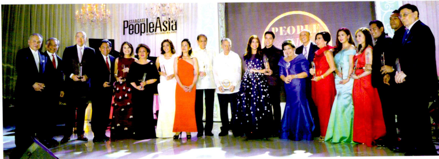
KINDRED SPIRITS. The 2015 People of the Year awardees of PeopleAsia magazine are bound by their sense of professionalism and integrity in their respective fields. Ombudsman Conchita Carpio Morales (sixth from left) is recognized for her exemplary work in government service. See complete story on page 4-5.