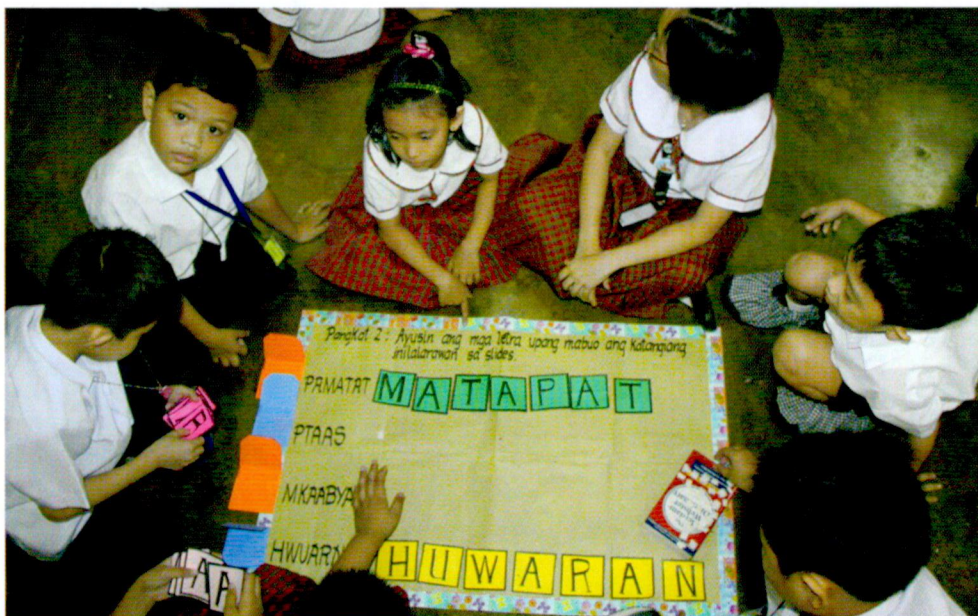
Grade 2 pupils of Doña Josefa E. Marcos Elementary School of Quezon City enjoy their group activity as they form two words, “Matapat” and “Huwaran”, from the jumbled letters given to them during the integration of good values of GCPE TE in Araling Panlipunan on October 28, 2014.

Copies of the book were given to Ombudsman officials, silver jubilarian employees, and integrity partners. (PIMRB)