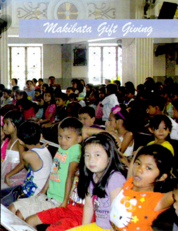
Makibata Gift Giving