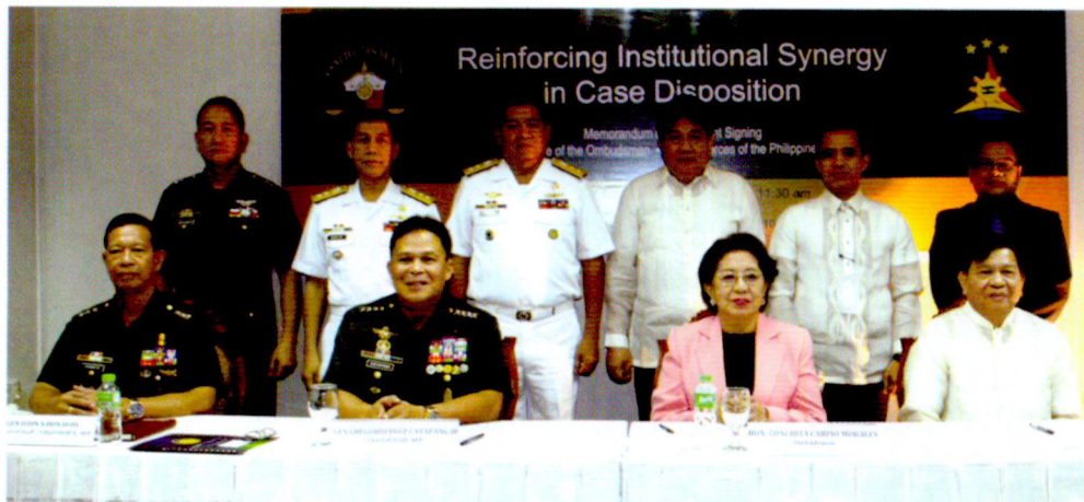
Ombudsman Conchita Carpio Morales and AFP Chief of Staff Gregorio Pio Catapang, Jr. pose with top-ranking OMB and AFP officials after the signing of the Memorandum of Agreement on November 14, 2014.

Poor families do not only pay a higher price for corruption because of the basic services denied them due to government funds lost to corruption. The 2013 survey also showed that incidence of bribe initiation is practiced more by families seeking basic social services compared to families transacting other services such as securing registry documents and licenses, accessing justice, and paying taxes and duties.