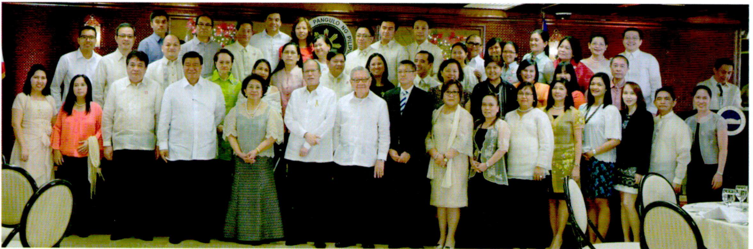
President Benigno Aquino III poses with Senate President Franklin Drilon, Speaker Feliciano Belmonte, Jr., Ombudsman Conchita Carpio Morales, Justice Secretary Leila De Lima, Executive Secretary Paquito Ochoa, Jr. and other key officials of the Office of the Ombudsman during the 2nd State Conference on UNCAC on December 2, 2014.

Enacted on May 27, 2013, Republic Act No. 10589 declares the observance of December every year as “Anti-Corruption Month” in the entire country. (PIMRB)