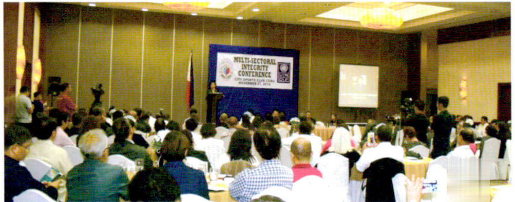
Ombudsman Conchita Carpio Morales addresses stakeholders in the Visayas coming from the academe, local government units, national government agencies, judiciary, private sector and the media during the Multi-Sectoral Integrity Conference in Cebu City on November 27, 2014 at the Cebu City Sports Club.