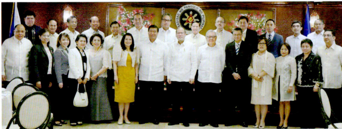
President Benigno Aquino III poses with Ombudsman Conchita Carpio Morales, Chief Justice Maria Lourdes Sereno, Senate President Franklin Drilon, Speaker Feliciano Belmonte, Jr. and other top government officials during the 2nd State Conference on UNCAC on December 2, 2014 held at Malacañan Palace.