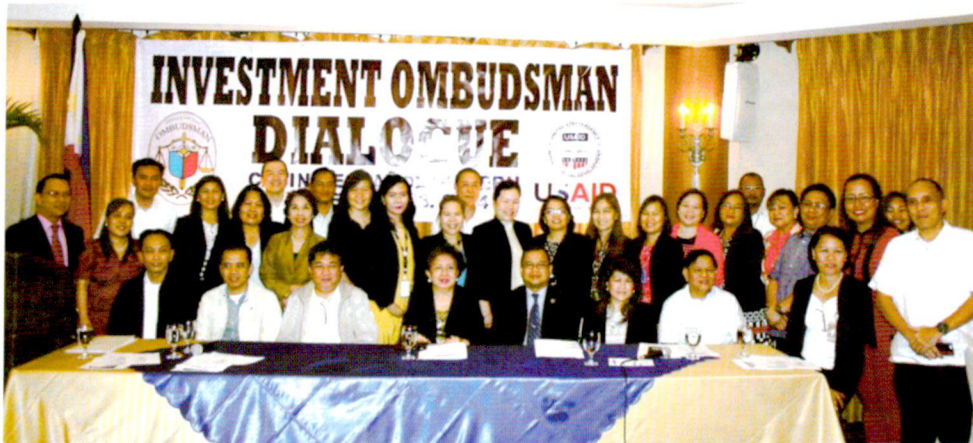
Ombudsman Conchita Carpio Morales with Ombudsman officials and OMB-Visayas employees during the Investment Ombudsman Dialogue in Cebu City on November 28, 2014 at Casino Español, Cebu City.

During the gathering of over 100 participants, Ombudsman Morales urged