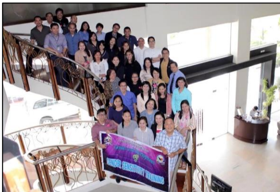
Group photo of the training participants with the GFPS Executive Committee Members. Close to 40 participants attended the seminar at the Pinnacle Hotel, Davao City.