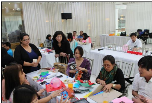
The participants creatively prepared their “baby balloons” as part of the workshop activity.