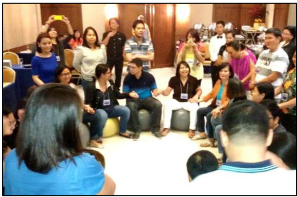
Group exercises were conducted during the stress management component of the seminar.