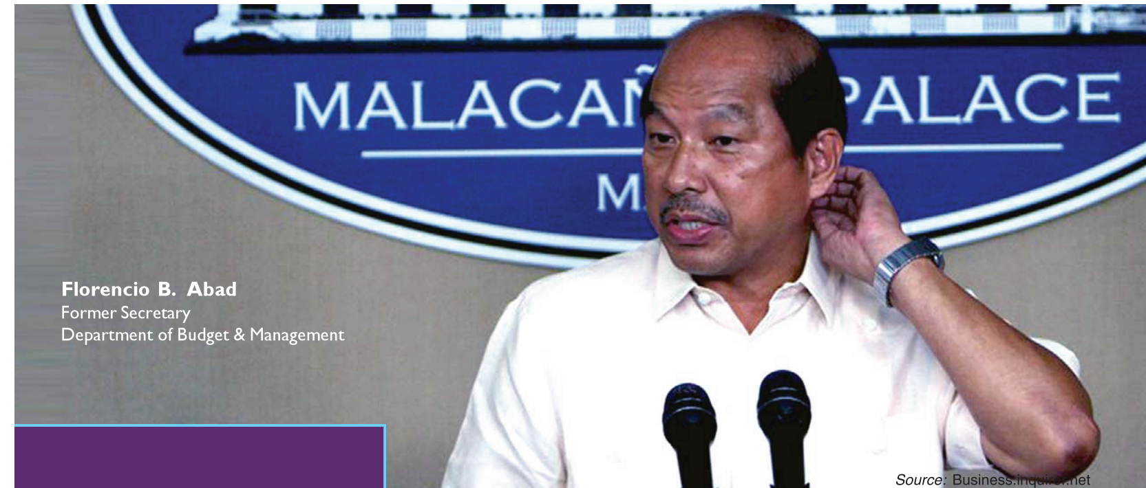
Florencio B. Abad Former Secretary Department of Budget & Management