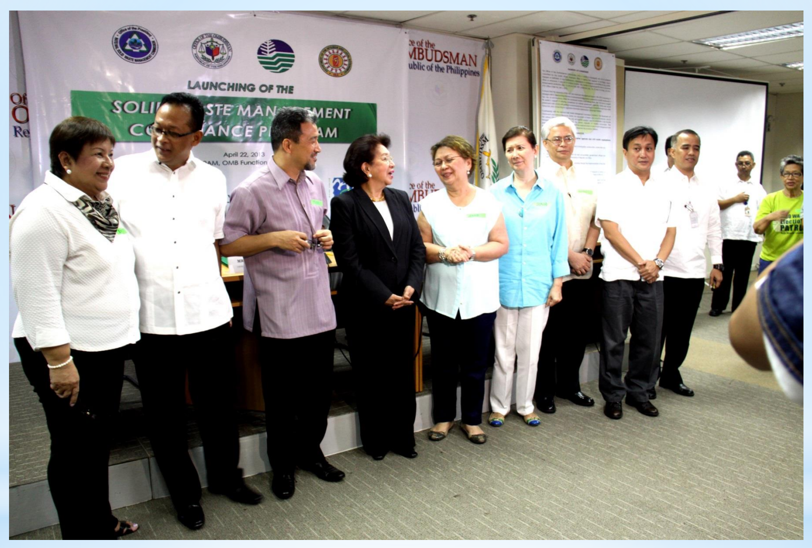
*Partners in Motion