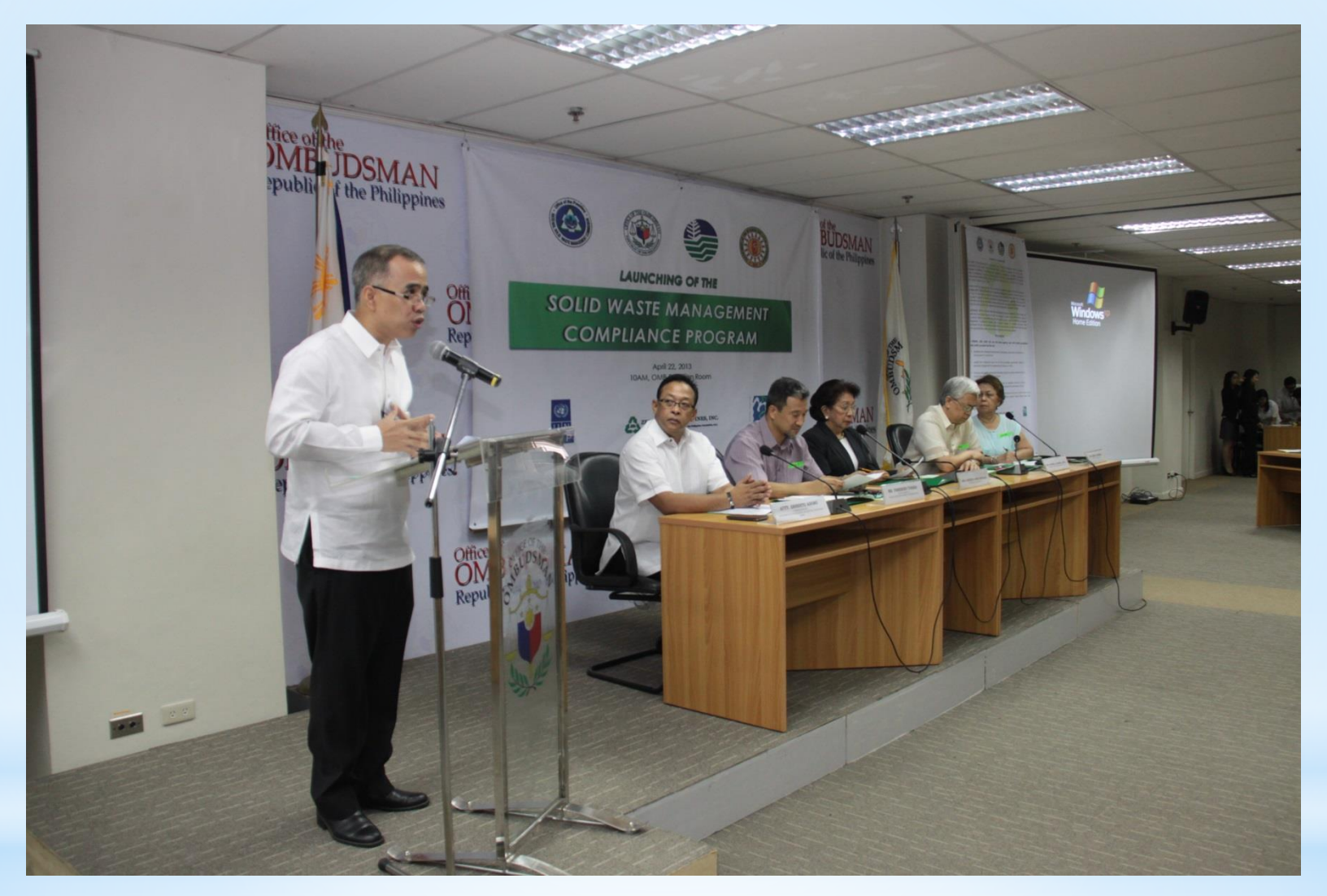
*Envi OMB at the Launch