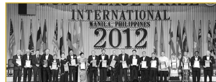
An Awardee of the 2012 Gusi International Peace Prize