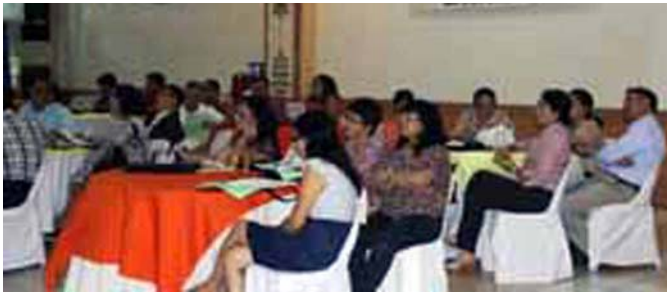
Participants from the member agencies listen to the resource person during the IAAGCC 2nd Cross Training for the Regional Auditors, Investigators, Prosecutors and Adjudicators held in Roxas City on 21-23 November 2012.

the following agencies: Office of the Ombudsman, Commission on Audit, Civil Service Commission, National Bureau of Investigation, Department of Justice, Office of the Deputy Executive Secretary for Legal Affairs, Department of Finance and the Department of Budget and Management.