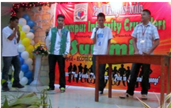
Participants from Region 7 deliver a special song number during the 2nd Visayas-wide Campus Integrity Crusaders Summit held in Cebu City

In 2012, six student-organizations were accredited as CICs. These CICs were actively involved in various activities which develop and ingrain in the youth such