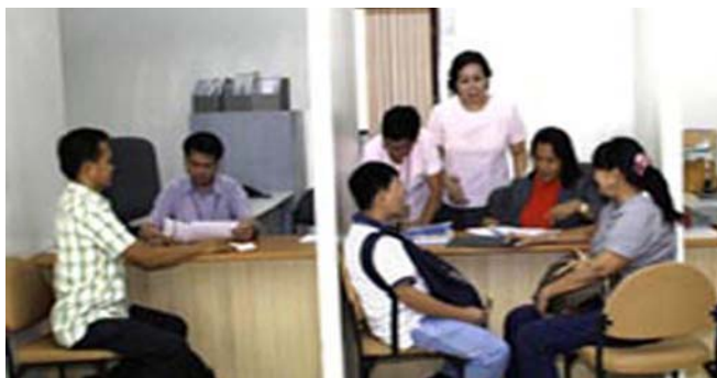
Action officers from the Public Assistance Bureau entertain walk-in complainants and requesters consistently with the policy to improve responsiveness of public assistance delivery.

in the performance of official functions. It serves as a venue for redress of grievance against public officials and employees for an act or omission which does not necessarily amount to an offense. It also extends assistance to citizens by ensuring the effective and responsive delivery of services by government agencies and functionaries. To discharge this function, the Office of the Ombudsman can direct the