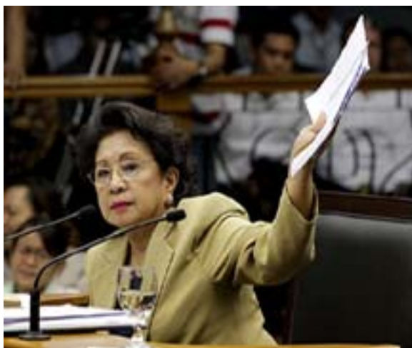
Ombudsman Conchita Carpio Morales appearing as a witness in the Senate hearing on the impeachment of former SC Chief Justice Renato Corona.

The preliminary investigation of 3,271 cases was terminated in 2012. Around 21% of these cases resulted in the filing of criminal information with the Sandiganbayan and regular trial courts while the rest were either dismissed or referred to other government agencies for appropriate action.