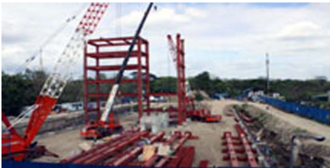
The new annex building slowly rises at the back of the old building to accommodate the growing personnel complement.

The main office of the Office of the Ombudsman is housed in an owned lot located along Agham Road, Diliman, Quezon City. The Office of the Deputy Ombudsman for Luzon and the Office of the Deputy Ombudsman for the Military and Other Law Enforcement Offices (MOLEO) are also housed in the same building on the 3 rd floor.