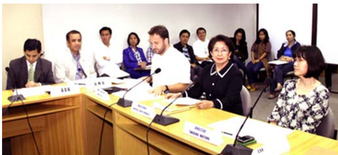
Ombudsman Conchita Carpio Morales, Chairperson of the Philippines Development Forum's Sub-Working Group on Anti-Corruption (SWGAC), presides in a meeting attended by representatives of government agencies, development partners and civil society organizations.

dialogue among stakeholders on the country's development agenda. It also serves as a process for developing consensus and generating commitments among different stakeholders toward critical actionable items of the Government's reform agenda.