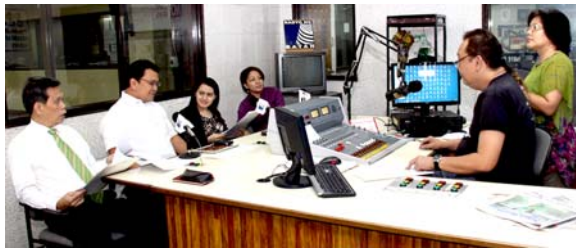
Resource persons from the Office of the Ombudsman discuss various issues in governance in the radio program "Magsumbong sa Ombudsman"

The Office of the Ombudsman utilizes the wide reach of broadcast media by airing a radio program on Radyo ng Bayan , DZRB 738 kHz titled Ombudsman Ngayon .