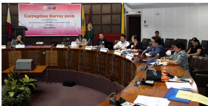
Distinguished members of the academe exchange their views in a forum to discuss the results of the 2010 National Household Survey on Actual Expenditure with Corruption in the Philippines held at the University of the Philippines.

Corruption Barometer. The low incidence of payment of bribe or grease money may be attributed to reduced red tape in government agencies, improved service delivery and customer satisfaction, or non-tolerance of corruption by the transacting public. Moreover, the least number of families paid bribe or grease money when accessing social services