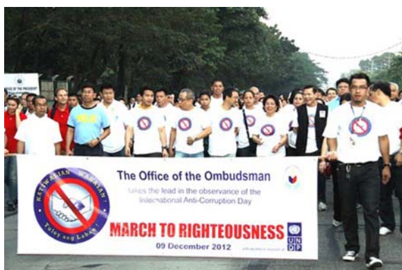
Ombudsman officials lead other government agencies and civil society organizations in celebrating the International Anti-Corruption Day by staging a March to Righteousness on 9 December 2012.

various government agencies, schools, civil society organizations, and development partners. The highlight of the march was a short program held at Quezon City Memorial Circle. A similar Integrity Parade was also organized by OMB-Visayas in Cebu City attended by thousands of people from both public and private sectors. The parade proceeded from Plaza Independencia to Cebu City Sports Complex where a brief program was held. In Davao City, an advocacy run titled “ Takbo ng Mamamayan sa Matuwid na Daan ” was organized by OMB-Mindanao at the Ateneo de Davao University campus in Matina District.