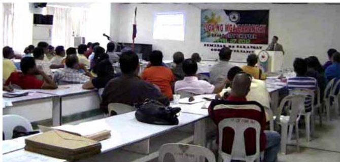
Barangay officials in Davao City listen during the seminar on barangay ethical and effective governance as part of the anti-corruption education initiative of the Office of the Ombudsman.

In order to promote integrity, accountability and transparency in government, lectures, seminars, workshops, and briefings on various topics such as anti-graft laws, powers and functions of the Office of the