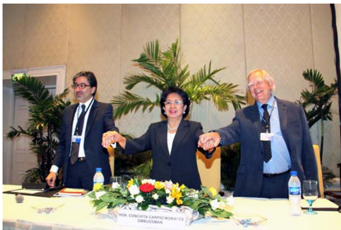
Ombudsman Morales join hands with the delegates of the Asia-Pacific Economic Cooperation (APEC) Anti-Corruption Code of Conduct for Business Forum held in Manila on September 20-21, 2012.

In 2012, the Office of the Ombudsman forged a Memorandum of Understanding with the Anti-Corruption and Civil Rights Commission of the Republic of Korea for the following areas of cooperation: knowledge sharing; opening of a complaints window for the overseas nationals of the other country; conduct of joint investigations and research; capacity building; and other areas as may be jointly decided upon.