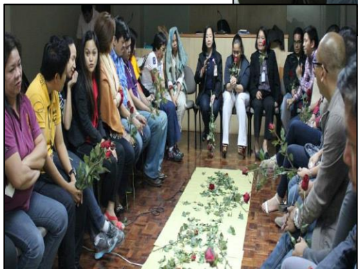
Individual GAD Plan Workshop