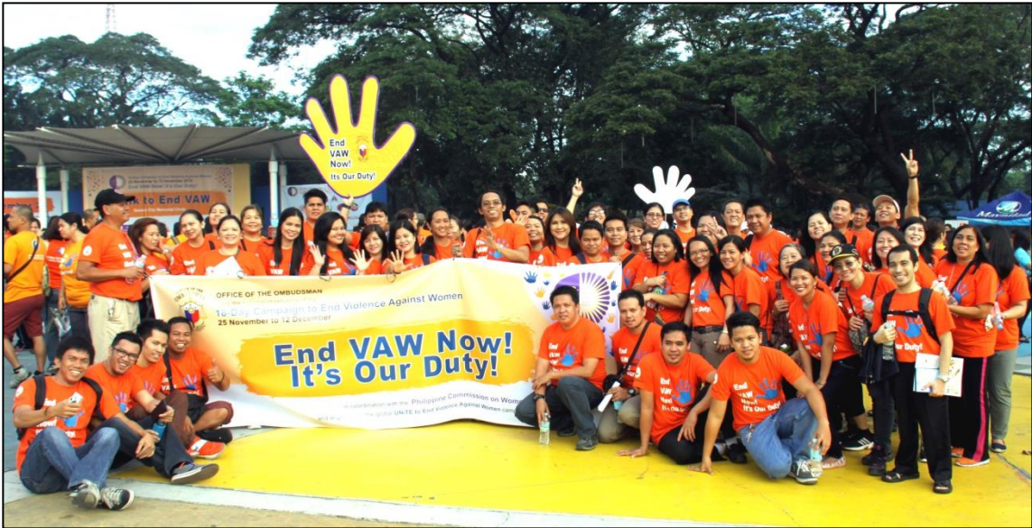
Participants from OMB-Central and OMB Sectoral/Area offices. This year's theme is: "End VAW Now! It is Our Duty".

Activity : WALK TO END VIOLENCE AGAINST WOMEN Date : 25 NOVEMBER 2014 Venue : QUEZON CITY MEMORIAL CIRCLE No. of Participants: 91