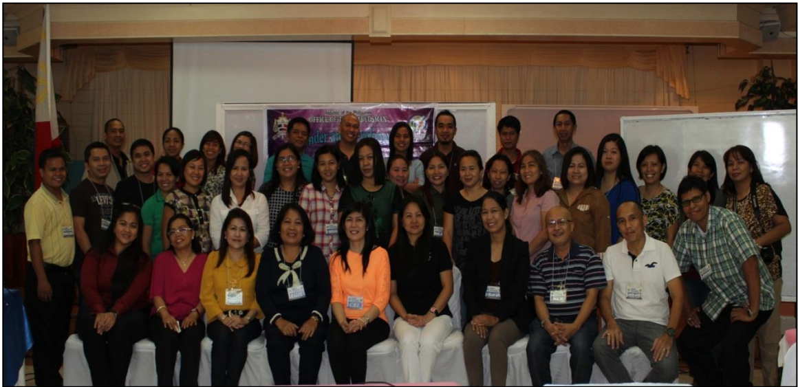
Participants from OMB-VISAYAS (Cebu, Iloilo and Tacloban)

Activity : GENDER SENSITIVITY TRAINING; LIFESTYLE AND WELLNESS OMB-VISAYAS (CEBU, ILOILO AND TACLOBAN) Date : 10-11 JUNE 2014 Venue : NORTHWINDS HOTEL, CEBU CITY No. of Participants: 30