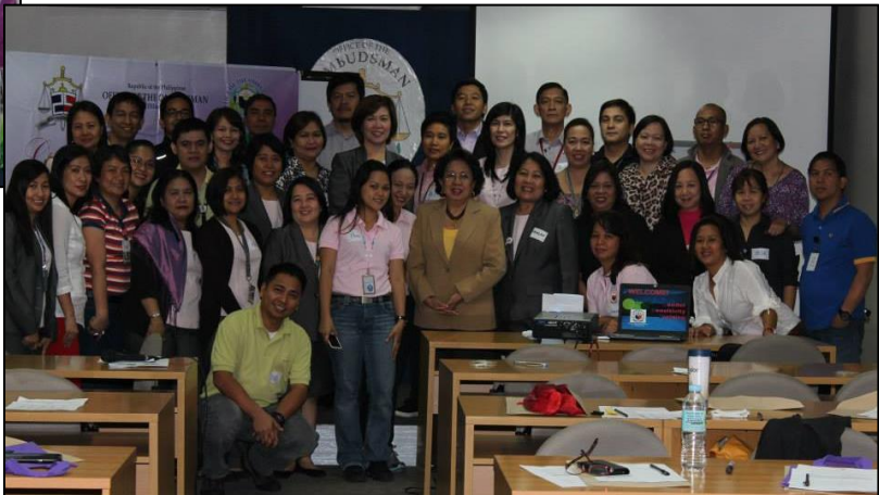
Hon. Conchita Carpio Morales, together with the participants from OMB-Central and Sectoral/Area Offices