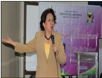
Hon. Ombudsman Conchita Carpio Morales

Activity : GENDER SENSITIVITY TRAINING; LIFESTYLE AND WELLNESS Date : 06-07 MARCH 2014 Venue : OMB FUNCTION ROOM, OMB-CENTRAL OFFICE No. of Participants: 30 employees from OMB Central Office